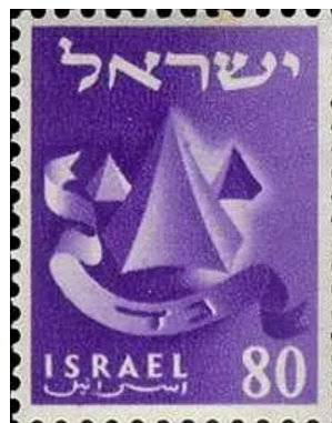
מה טובו אהליך יעקב